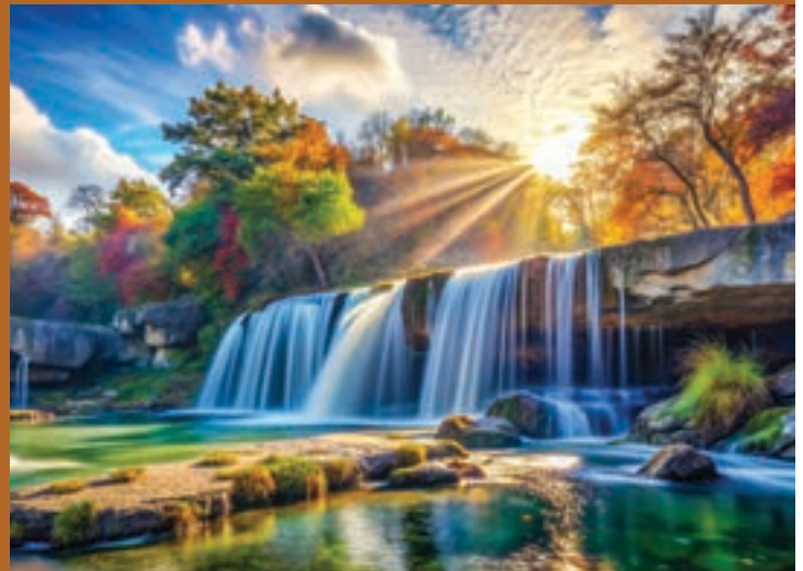
MCKINNEY ROUGHS PARK