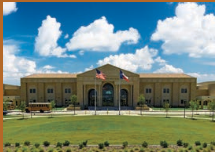
WALNUT GROVE HIGH SCHOOL

The Planned Amenity Center renderings are the artist's concepts and are subject to change without notice.