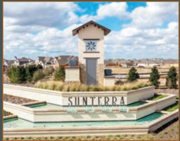
SUNTERRA – HOUSTON