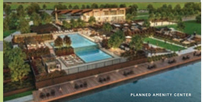
PLANNED AMENITY CENTER