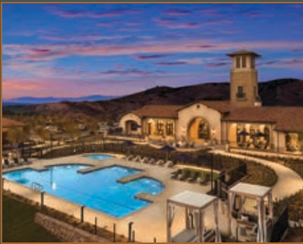
TERRAMOR – LOS ANGELES

In 2025 Starwood Land acquired 11 master-planned communities comprising more than 16,000 homesites and 600 acres of commercial property in three of the Top Ten largest U.S. new home markets – Dallas, Houston and Austin. In 2025, for the third consecutive year, Starwood Land's Sunterra in Houston is the #1 selling community in Texas.