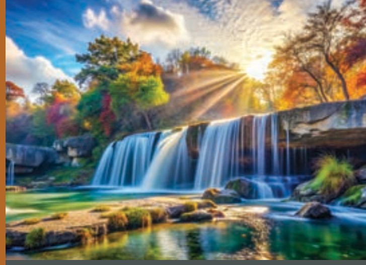
MCKINNEY ROUGHS PARK