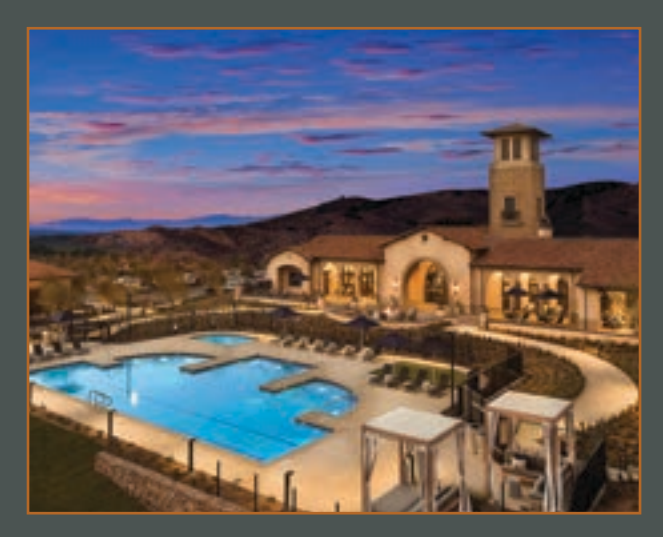
TERRAMOR - LOS ANGELES

In 2025 Starwood Land acquired 11 master-planned communities comprising more than 16,000 homesites and 600 acres of commercial property in three of the Top Ten largest U.S. new home markets – Dallas, Houston and Austin. Sunterra in Houston, a Starwood Land community, was the #1 selling community in Texas in 2023 and 2024.